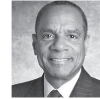
KENNETH I. CHENAULT Chairman and Managing Director of General Catalyst Partners