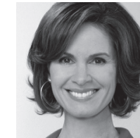
ELIZABETH VARGAS Co-anchor, ABC News' "20/20"