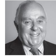
JOSEPH A. CALIFANO, JR. Founder and Chairman Emeritus