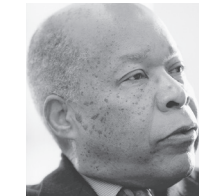
LOUIS W. SULLIVAN, M.D. President Emeritus, Morehouse School of Medicine