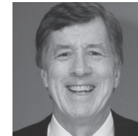
JAMES M. RAMSTAD Former Member of Congress (MN-3)