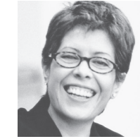
COLUMBA BUSH Former First Lady of Florida